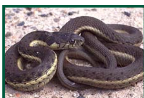
Two-striped garter snake