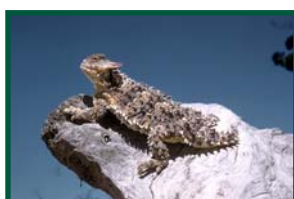
San Diego horned lizard