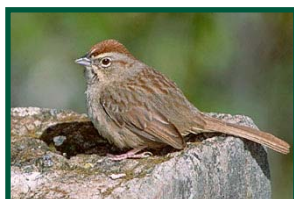
Southern California rufous-crowned sparrow