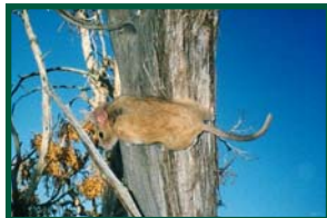
San Diego desert woodrat

Sensitive species are those that are declining at a rate that could result in listing as threatened or endangered; and or have historically occurred in low numbers and known threats to their persistence currently exist. The park contains over twenty species that are recognized by the resource agencies as sensitive.