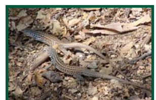
Coastal western whiptail lizard