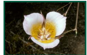
Plummer's mariposa lily ( Calochortus plummerae )