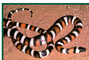
San Bernardino mountain kingsnake