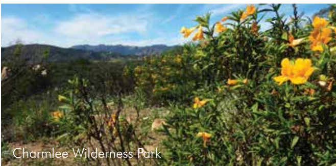
Charmlee Wilderness Park

Tips: Free program, $4 parking • Rain cancels outdoor programs • Programs are for all ages • Please, no dogs on programs Sponsored by Santa Monica Mountains Conservancy and presented by Mountains Recreation & Conservation Authority